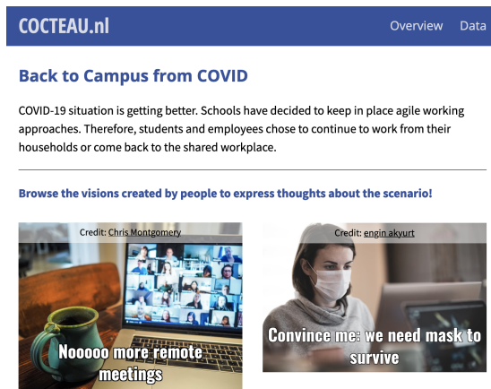
Figure 2: Feed of the visions created by all the users

the collected perspectives (share). A scenario on COCTEAU was set up with questions related to urban challenges. At the beginning of the studio, the coach introduced COCTEAU, and all the students were asked to answer the questionnaire on the platform individually. After that, the coach asked students to check all answers (submitted by others and displayed on COCTEAU) and discuss them with their neighbours. Then, students were asked to brainstorm ideas with all group members based on the shared answers. Also, the coach informed students that they could create visions (image with caption) related to the urban challenge the group was interested in exploring. The coach also showed how they could check others' visions in the tool. Finally, they were asked to keep working on brainstorming ideas and reaching a consensus on the desired topics.